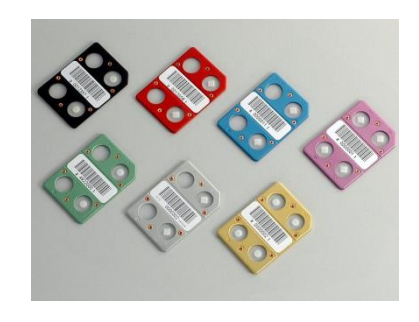
Aluminium TLD cards