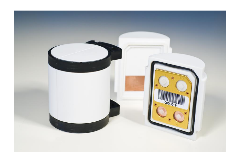
DORIS = DO simeteR for Indoor and outdoor Surveys